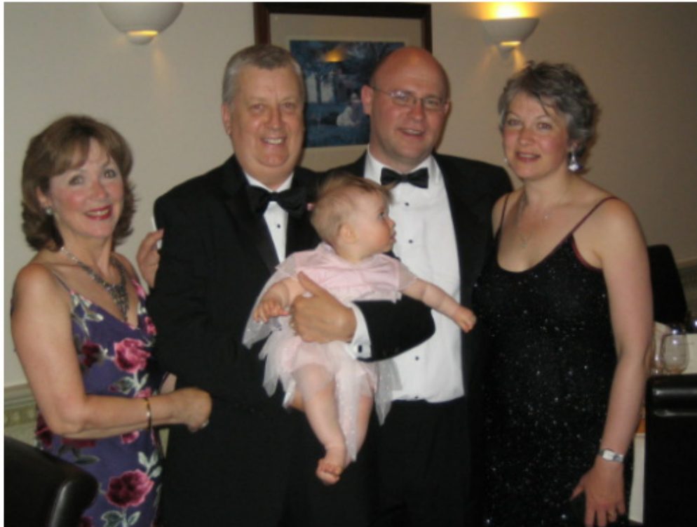
The Daisy Garland Annual Charity Ball at Warren House, Kingston-upon-Thames

The Daisy Garland Annual Ball and Charity Auction will be held on Saturday the 28th of March in the fabulous setting of Warren House, Kinston-upon-Thames. Pre-dinner drinks at 6.30pm followed by a delicious hot and cold buffet supper with dancing until midnight. Amazing raffle and auction prizes. Tickets are on sale now. Please e-mail us at www.thedaisygarland@btinternet.com to reserve yours today.